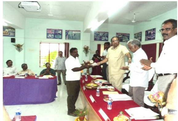
KVK, Needamangalam awarded Vivasayee Sathanaiyalar Virudhu