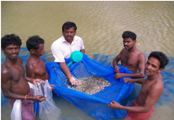
Demo on rearing of fingerlings in Hapas