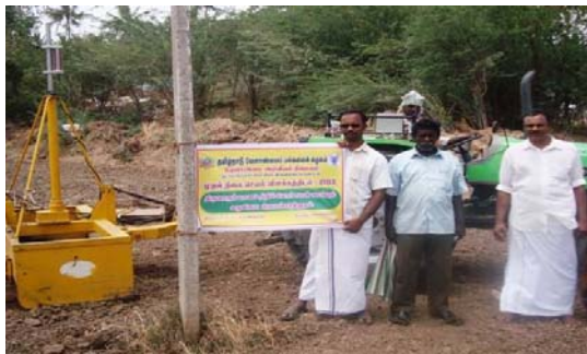
Demonstration on lazer guided leveller