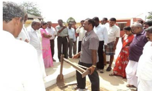
Demonstration on bund trimmer