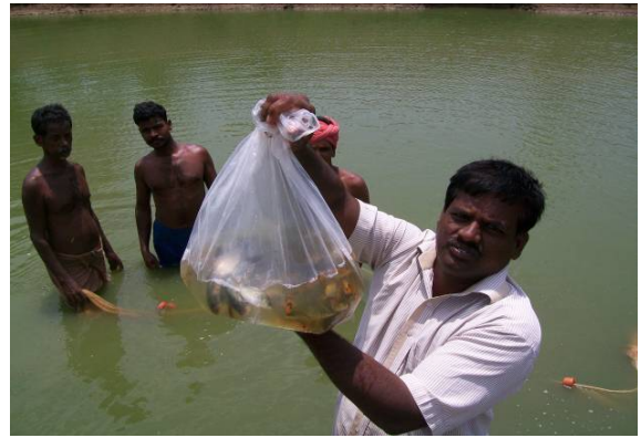
Stunted fingerlings production