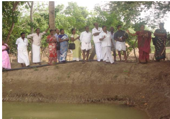
As master trainer in fish culture training