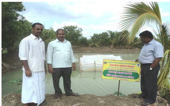
FLD on rearing of fingerling in hapas